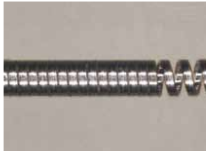
Flat wire coiled tubing