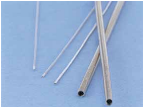
Coil of Guidewire / Shaft of Catheter