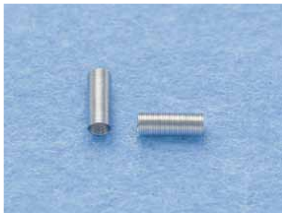
Radiopaque Marker Coil